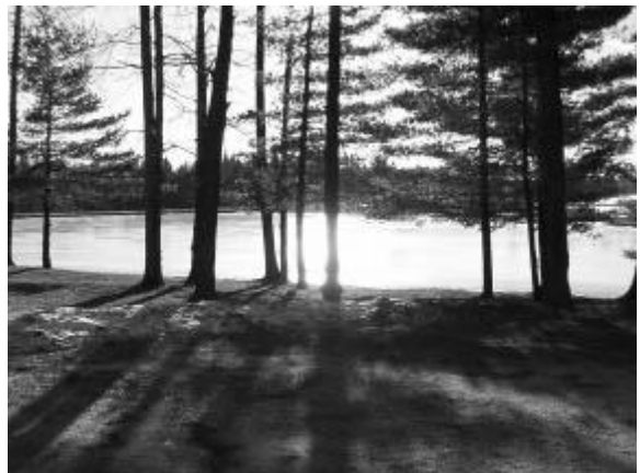
Indian Lake at Camp Stigwandish