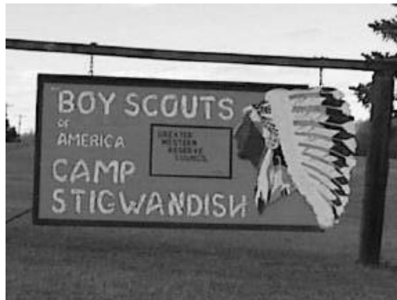
Camp Stigwandish Entrance Sign

Boots are a requirement for all Troop One campouts. Come prepared for all types of weather.