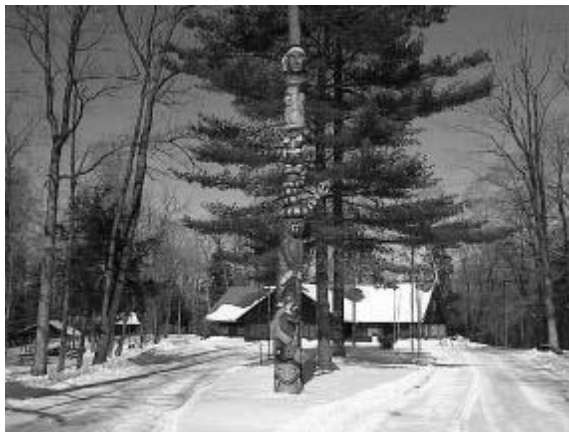
Camp Stigwandish Totem Pole

Special requirements - Listed on the back, including any instructions and written permission for any medication to be dispensed. All medicine must be in the original container.